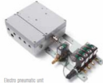
Electro pneumatic unit