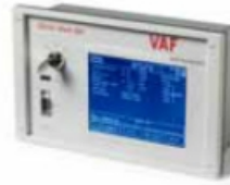
Main control unit

Dimensions (W x H x D): 257 x 157 x 126 mm