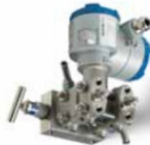
Electronic differential pressure transmitter

Dimensions (W x H x D): 225 x 195 x 194 mm