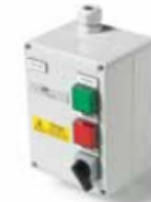
Motor starter box

Dimensions (W x H x D): 126 x 176 x 100 mm